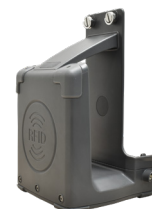
UHF Pistol Grip